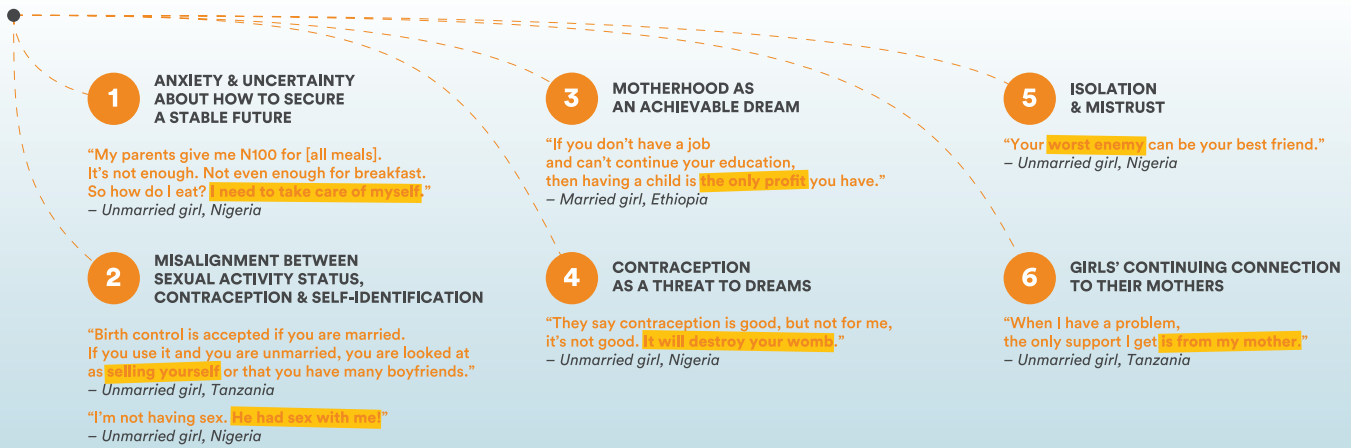
Figure 2: Six Dominant Themes Across Countries

Field research conducted during the inquiry phase yielded insights specific to each country, which were subsequently grouped into the six cross-country themes shown here.